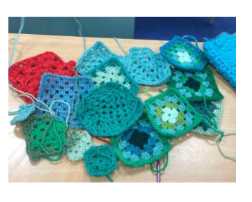
Crochet club are producing some wonderful work.

YR went outside to learn more about the frost.